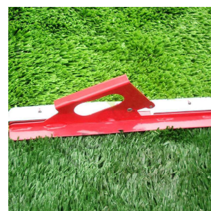
Grass Cutter for proper cutting alongside of existing track seams. Size(cm) 50x8x15 Weight (kg) 1.60