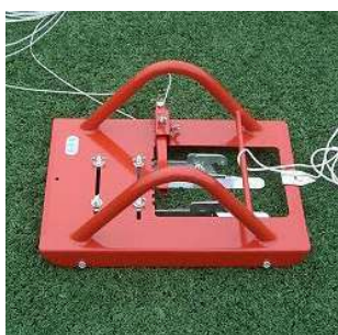
Line Cutter for cutting variable width of straight lines. Size(cm) 49.5x36.5x22.5 Weight (kg) 8.75