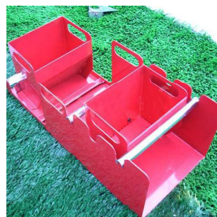
Glue Fix applicator for glue coating of seam tape. Stationary version Size(cm) 76x33x25.6 Weight (kg) 18.20