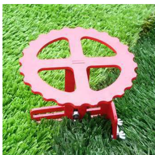
Circle Cutter for circular cuttings. Size(cm) h19x18 Weight (kg) 1.50