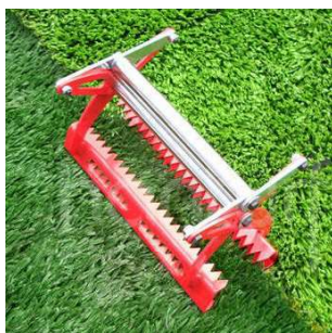
Turf Grip for a fast and easy alingment of strips. Size(cm) 34.5x30.1 Weight (kg) 4.80