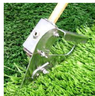
Edge Trimmer for trimming of strips. Size(cm) 50x15 Weight (kg) 0.65