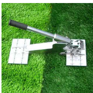
Turf Fix for fix the joints of strips while glueing. Size(cm) 50x20x21 Weight (kg) 6.40